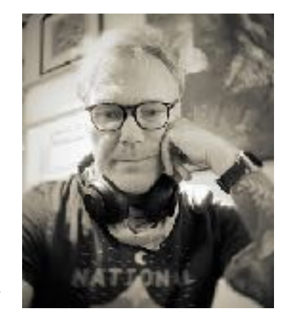
I-LA Program Director during the lock-down.

It is certainly understandable to feel bewildered by the fact that you just happen to be in college during a pandemic! However, with adversity also comes opportunities to learn new skills or to test the skills you now do possess. Refiguring what your classroom presence is now, what your organizational capacity needs are, how you're 'keeping straight' all of these sudden and shifting new demands on your time are, these are all invaluable challenges that do better prepare you for your career life to come after graduation. I could go on, but I won't. I will, however, leave you with the only message this semester makes obvious: you all do I-LA proud.